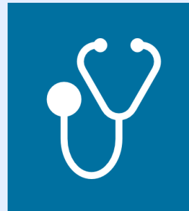
Physicians & Professionals