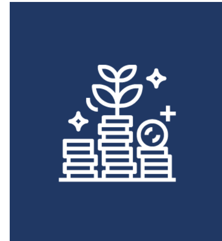
Leaving a Legacy for Future Generations