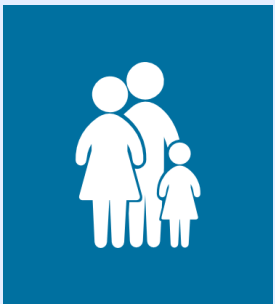
High Net Worth Individuals & Families