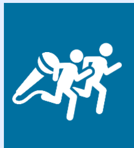
Professional Athletes & Entertainers