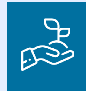
Farmers & Ranchers